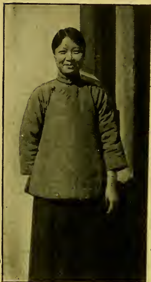
Chinese Teacher at Yenching College.

plays to coach, trips together, etc., and how they do love helping us to talk, and laughing at our mistakes. Some who live in town have taken me home and many are particularly friendly. It makes all the difference in the world to be able to talk to them in their language, even a little!